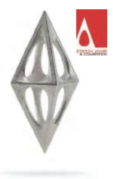
Winner of Silver A'Design Award

Jumping out of the ocean, the whale, with its dynamic silhouette, is the muse to its design team--Favaretto & Partner, a renowned Italian design studio. With whale as its prototype, SAMU adds a natural flair to modern office. This creative design has also captured the silver award at 2018 A'Design Award & Competition, bravo!